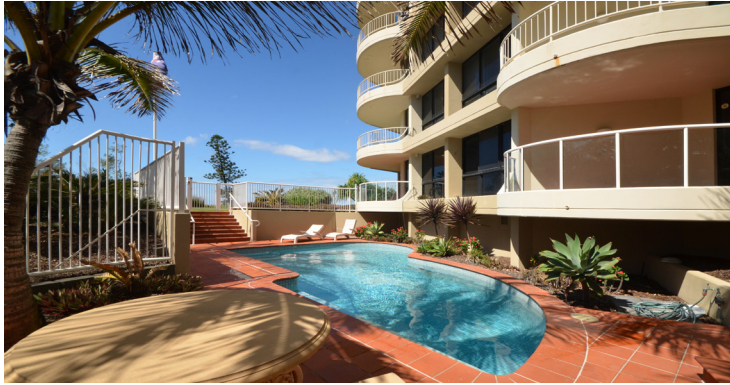
1/255 Hedges Avenue, Mermaid Beach Beachfront ground floor luxury unit sold for $1,420,000.

Desirability for beachfront units was evidenced with the sales of the three-bedroom, ground-floor unit in "On the Park" at 255 Hedges Avenue for $1,420,000.