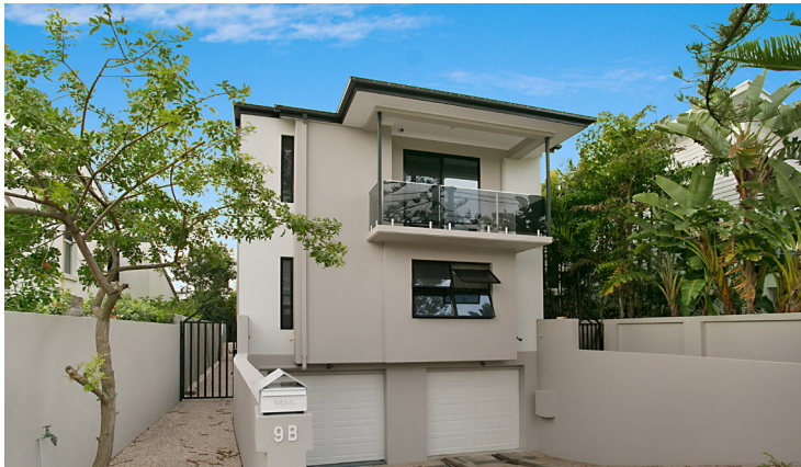
9 Tamborine Street, Mermaid Beach Duplex pair sold for $1,815,000

Strong demand from buyers and limited supply is leading to great activity for houses and whole unit blocks in the beachside area. Some great sales include 34 Heron Avenue which sold for $1,550,000, 9 Tamborine Street for $1,815,000, 42 Ocean Street for $1,095,000 and 2291 Gold Coast Highway for $873,600.