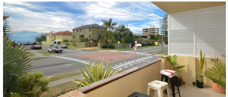
2/5 Wave Street, Mermaid Beach Prime location with ocean views sold for $533,000

A beachside corner block of 6 x 2 bedroom and 3 x 1 bedroom units on a 1,222m2 corner sold at Auction for $3,000,000, while 2 units in the 'Alexis' building at 19 Mermaid Avenue sold for $770,000 and $1,200,000 respectively.