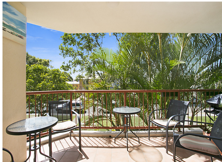
3/6 Petrel Avenue, Mermaid Beach Sold by Perry Brosnan for $630,000

A two-bedroom ensuite unit sold for $512,000 "Veniza" in Venice Street Mermaid Beach, a unit in "Volante Court" at 27 Peerless Avenue - two bedrooms in small block of 6 - sold for $460,000 and a three-bedroom unit in "Kaleen Surfside" in Petrel Avenue at Nobby Beach sold for $630,000.