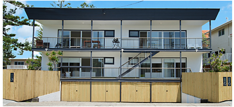
182 Hedges Avenue, Mermaid Beach Sold for $2 million Sold by Luke Henderson

Buyer demand remains strong in this market segment with some Villa sales of note being 1/21 Ventura Road selling for $1,300,000, 2/87 Seagull Avenue selling for $898,000 and 1/95 Seagull Avenue selling for $785,000. A ground floor 3-bedroom apartment in "Hedges 252" achieving $1,630,000. There have been numerous 2-bedroom unit sales in beachside streets ranging from $362,500 to $580,000.