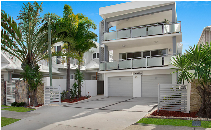
1/21 Ventura Road, Mermaid Beach Sold for $1.3 million Sold by Evelynne Castaldi & Jeff Burchell

Beachfront property is scarce with properties remaining tightly held. Over the past quarter there was 2 absolute beachfront sales in "Albatross North" with a 3-bedroom apartment selling for $1,087,500 and 2-bedroom apartment for $700,000. If you want to purchase on the beachfront we have a number of great properties going for sale at our Hot Summer Auction Event on the 23rd of January.