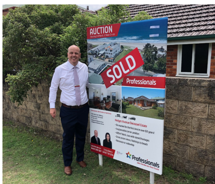
46 Hedges Avenue sells at auction for $1,771,500

If you are seeking to purchase beachfront real estate in Mermaid Beach or Miami we have a number of two and three-bedroom apartments for sale in Hedges Avenue, Albatross Avenue and Marine Parade. Remember, they are not making any more beachfront!