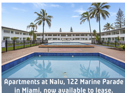
Apartments at Nalu, 122 Marine Parade in Miami, now available to lease.

Some of our sales for older style two-bedroom units include "Norfolk Manor" at 26 Montana Road for $380,000, "Kalahari Palms" at 32 William Street for $470,000, "Castle Lodge" at 78 Petrel Avenue for $477,000 and 2341 Gold Coast Highway at "Splendido" for $445,000.