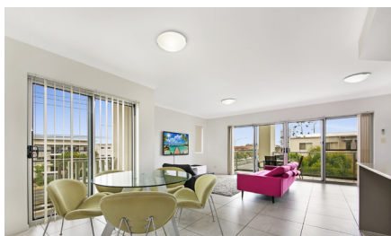
30/2341 Gold Coast Hwy sells post-auction for $445,000

These types of property are becoming very rare, so don't look back and one day say 'I could have' or 'I should have' bought one.