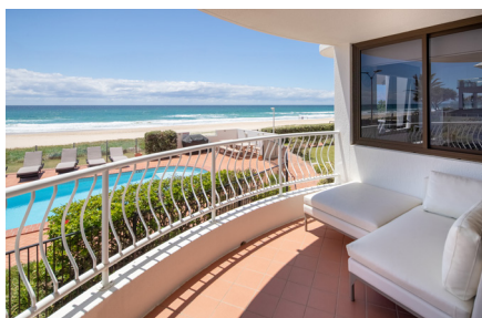
1/125 Albatross Avenue sells for $800,000

Every sale detailed in this report has been sold by our office. Make sure you are dealing with the agents negotiating the sales, not just talking about them. We have been the market leaders and number one selling agency in the area for over 46 years.