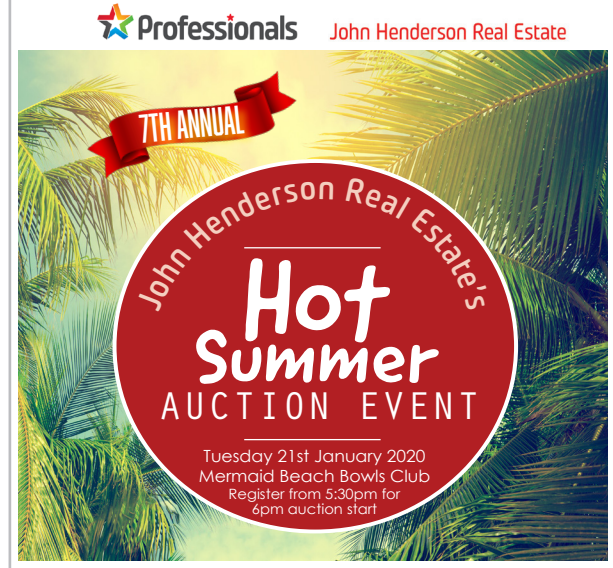
Learn more about our famous inroom auctions and read all about the properties for auction on the night at ilovemermaid.com.au