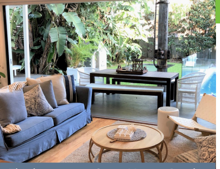
This home at 12 Santa Monica Road is available to lease for $1,500 per week