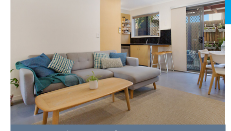
4/198c Hedges Avenue sold for $420,000